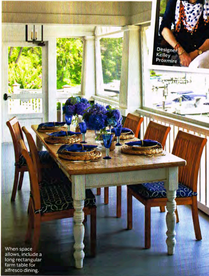
When space allows, include a long rectangular farm table for alfresco dining.