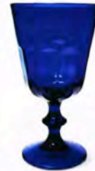
GLASS Le Cadeaux Bistro Blue Shatter Proof Glasses, $31.50/4; touchofeuropa.net