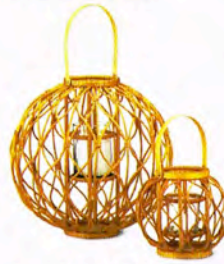
LANTERNS Caren Lanterns, $59.95 (large) and $24.95 (small); crateandbarrel.com