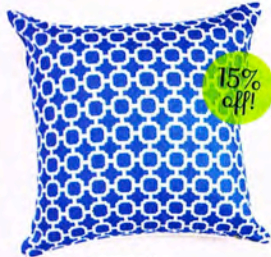
PILLOW Blue Blocks Throw Pillow by Jiti, $79.99; outdoorpillowsonly.com 15% discount with code SL15