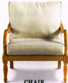
CHAIR Ceylon Teak Lounge Chair, $489; ballarddesigns.com